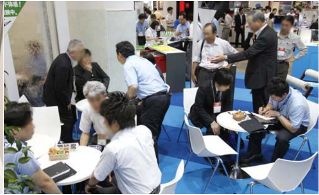
※Exhibitors held deep business discussions in their booths